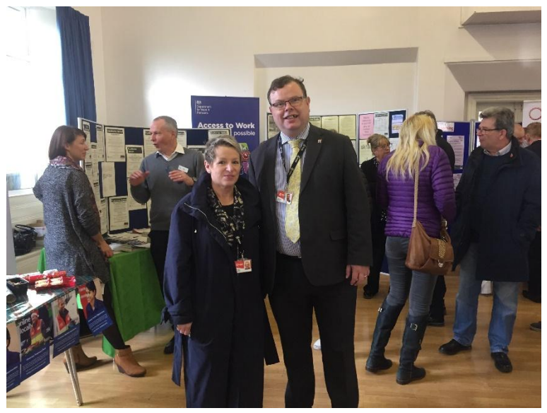
Jobs Fair at Acomb Parish Hall 15th November

I was delighted to attend the Acomb Jobs Fair on the 15<sup>th</sup> November, an event that was well attended by members of the public, with over 200 people having attended the event by midday. 28 employers were in attendance to help support local communities with assistance with job searches, composing applications and accessing vital training. This had been organised with the support of York Learning and 4Community GrowthYork, the latter providing a range of services around communities in most need in the city and successfully applying for grant funding to enhance provision of support.