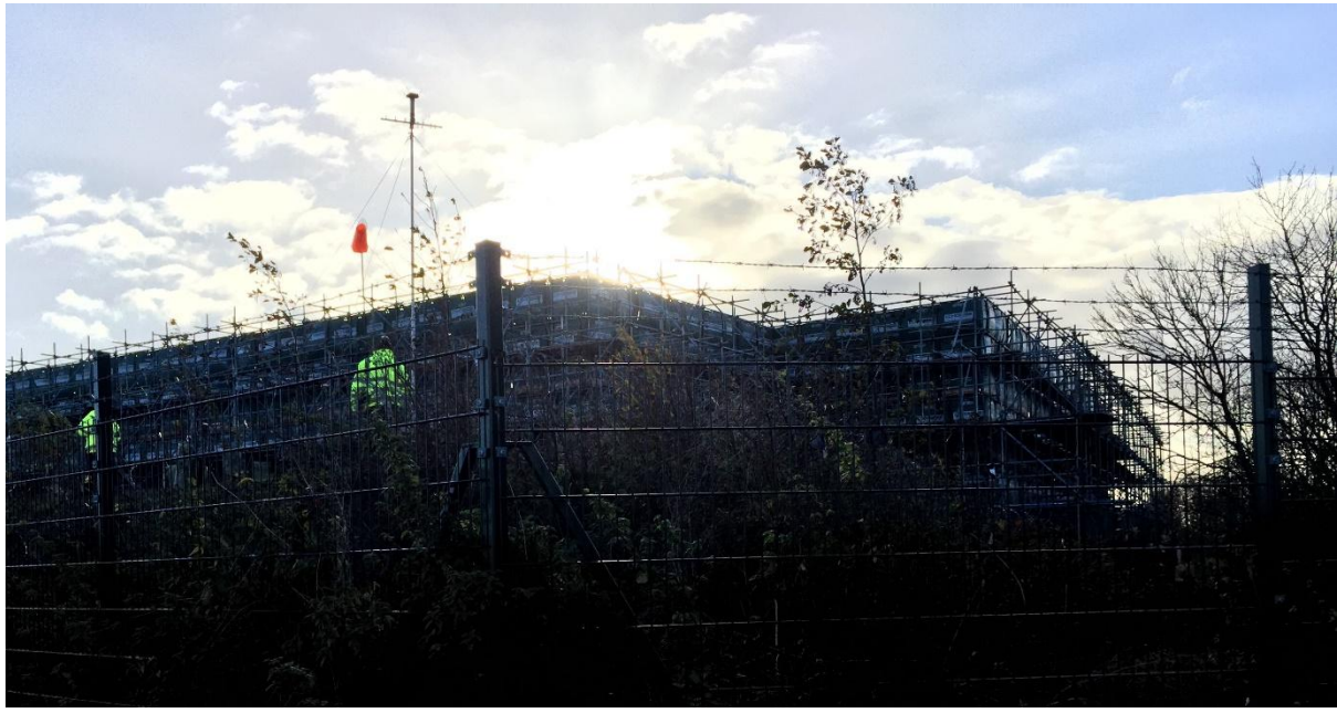
Frack Pad at Kirby Misperton

To access the Minerals and Waste Joint Plan Submission documents, and a range of supporting material, please visit the Examination website: <u>www.northyorks.gov.uk/examination</u>.